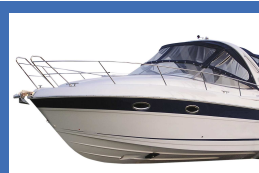
Boat / Ferry